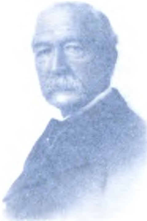
THE HONORABLE LAMBERT TREE OF CHICAGO, ILLINOIS